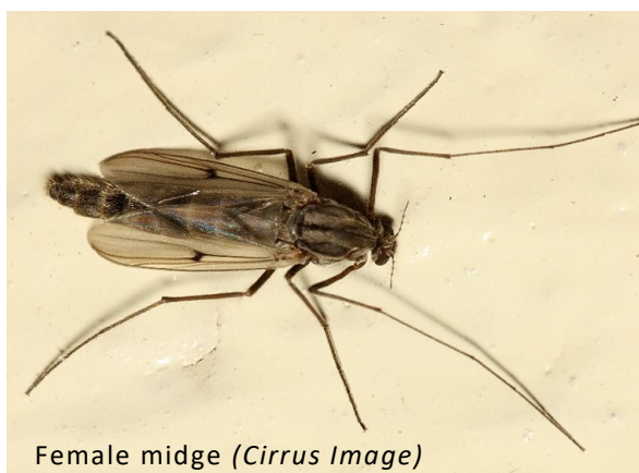
Female midge