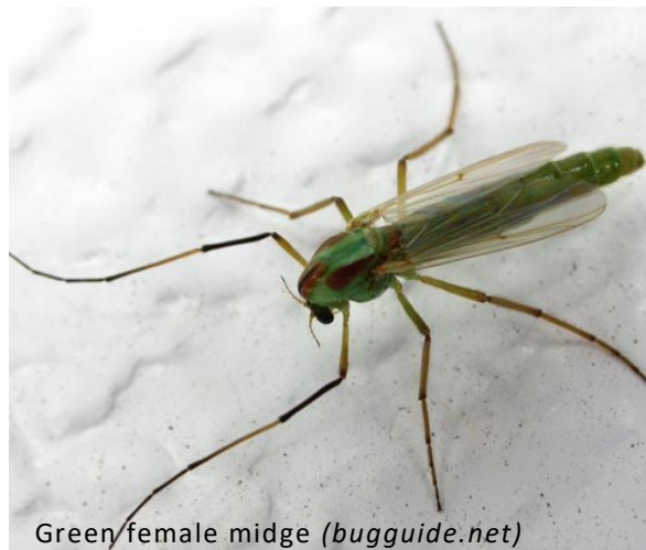
Green female midge

When a large number of midges emerge, they invade nearby residences, becoming an annoyance, disrupting outdoor activities such as jogging, barbecuing, etc. around dusk. They are attracted to outdoor lights located within about a quarter mile of their breeding sources and may enter homes. Flying adults can become stuck on newly painted surfaces and can damage walls, ceilings, curtains, and other property. They can be found resting on cars, screen doors, windows, walls, under eaves, porches, entryways, bushes and other vegetation.